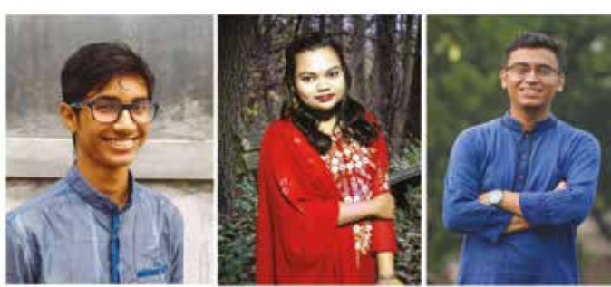
Students of SEU Recruited as BYCN Ambassadors

Bangladesh Youth Climate Network (BYCN) was looking for some talented & energetic students who care for the environment & work for the betterment of nature to recruit as ambassadors. Students from different universities completed their registration to join as