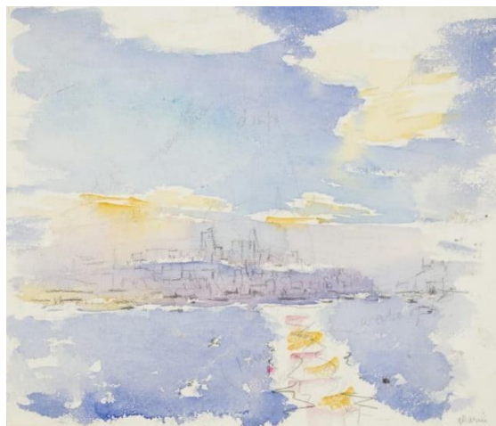
Figure 05: John Marin, "Manhattan Skyline from the River," 1909-12, watercolor over graphite on paper, 11 1/2 x 12 3/4 inches, Arkansas Art Center

Watercolors, a versatile type of paint that can be diluted with water to produce translucent layers of color on paper, are believed to have existed since Paleolithic cave paintings. However, it was during the Renaissance period that watercolors saw a surge in popularity as a recognized and valued artistic medium ("Watercolor," n.d.). Inspired by the vibrancy, clamor, and vastness of the rapidly growing modern city, American artist John Marin (1870-1953) pushed the boundaries of color and line in his watercolor paintings, creating works that bordered on abstraction (Kane, 2022) (Figure 05).