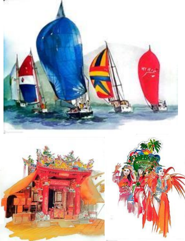
Figure 04 (from left) King's Cup Regatta, Shrine gates, Carnivals

In each stroke, the artist weaves a tale, taking the viewer on a visual odyssey through the enchanting landscape of Phuket's culture, history, and natural beauty. A true virtuoso of watercolor, his artistry leaves an indelible mark on the soul, creating an enchanting symphony of colors that resonates long after the last brush has been laid to rest.